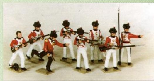
"The Royal Marines 1805", a set of toy soldiers depicting the Royal Marines at the time of the Battle of Trafalgar.