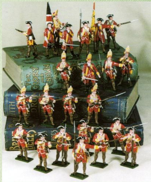
Some of the toy soldier sets in the recently released "French and Indian Wars 1750's" series.