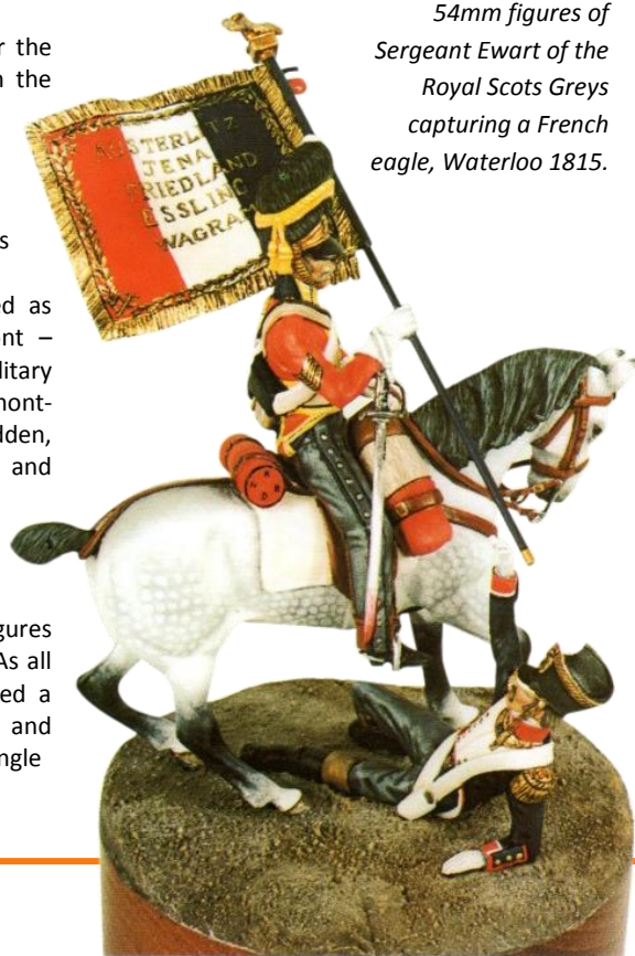
54mm figures of Sergeant Ewart of the Royal Scots Greys capturing a French eagle, Waterloo 1815.