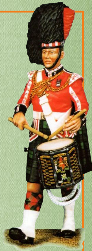
90mm figure of a Drummer of the Black Watch, present day.