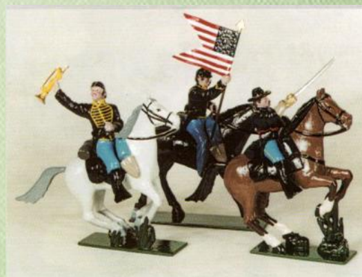
"Union Cavalry", one of the many American Civil War toy soldier sets by Tradition.