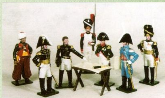
"Napoleon's Headquarters", one of the many Napoleonic subjects in the toy soldier range.