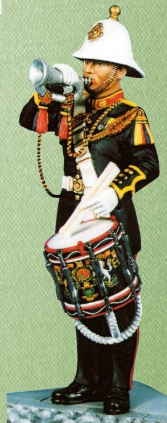
90mm figure of a Bugler of the Royal Marines, present day.

Scandinavia", but the remaining ranges are still very much in production today.