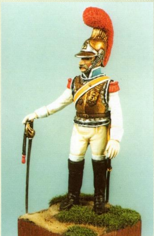
54mm figure of an Officer of French Carabiniers c.1812